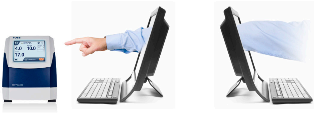
The power of networking: instruments can be monitored remotely by experts in NIR, calibration data can be collected and transferred, and calibration updates/instrument adjustments can be made without the local user having to take any action.